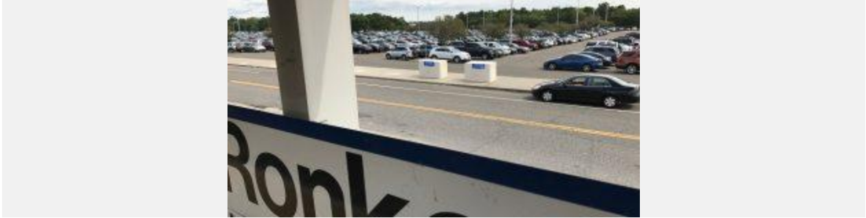
Ronkonkoma LIRR parking lot to be redeveloped

The development site includes about 40 acres of county-owned parking lot currently leased to the Metropolitan Transportation Authority, a 6-acre town-owned parcel just east of the parking lot and a 40-acre Islip-owned compost site south of Railroad Avenue.